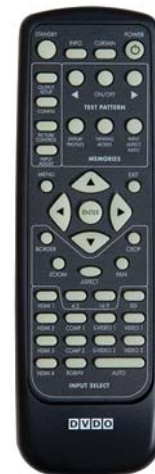
Infrared Remote Control with Discrete codes